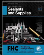
» WEB-S3 Sealants and Supplies