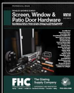
» WEB-03 Screen, Window and Patio Door Hardware