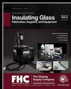
» WEB-13 Insulating Glass Fabrication, Supplies, and Equipment

EXPLORE ALL FHC PRODUCT LINES ANYWHERE, ANYTIME