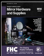
» WEB-M3 Mirror Hardware and Supplies