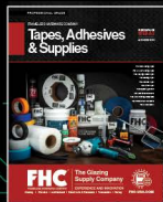
» WEB-A3 Tapes, Adhesives and Supplies