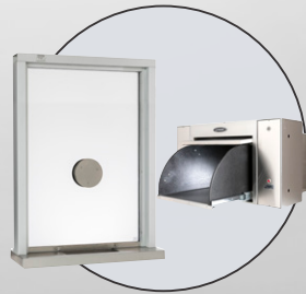
Transaction Windows & Drawers