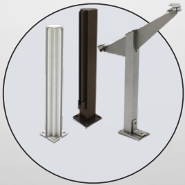
Diack Partition Post