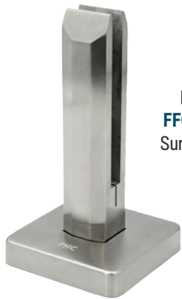
MODELS FFC1 & FFC2 Surface Mount