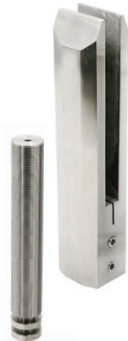
MODELS FFC3 & FFC4 Core Mount