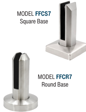
MODEL FFC7 Square Base